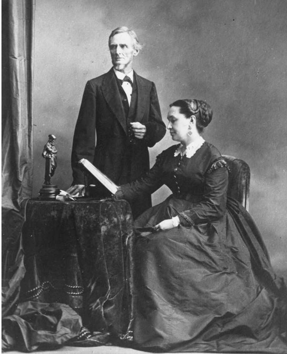
Jefferson and Varina Davis

This week we celebrate the birthday of Jefferson Davis, who was born on June 3rd, 1808. He lived until December 6th, 1889. He was born in Fairview, Kentucky and died New Orleans, Louisiana. He is buried in Hollywood Cemetery in Richmond, VA.