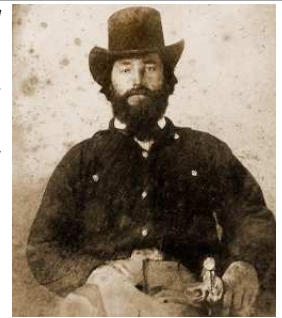
Br. Gen. John T Hughes

October 10-11 Shoal Creek Civil War Battle of Reenactment (Hodge Park near Liberty on 152 Hwy) This will be a MCWRA Max effort full scale reenactment. Another good place to set up our booth.